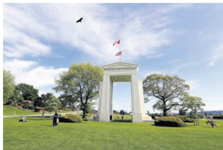
In this photo taken Sunday, May 17, 2020, a bird flies from the U.S. into Canada over the Peace Arch in Peace Arch Historical State Park on the border with Canada, where people can walk freely between the two countries at an otherwise closed border, in Blaine, Wash.